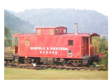
Caboose at Duffield

Rail cars are also being used for other purposes along the trail which have helped to preserve them for future generation. The Coal Heritage Trail Train museum just outside of the town of Haysi is housed in an old rail car. And two cabooses next door are used for lodging for the Red Caboose Bed & Breakfast. The Railroad Museum in Duffield houses some of its railroad memorabilia in Norfolk & Western caboose. There is also a rail car featured at the park in Coeburn and Pennington Gap has plans to convert their Southern caboose into an interpretive visitor information center for the Virginia Coal Heritage Trail.