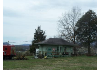
A railroad museum in Duffield is in a depot from a movie set

But where there were once a depot in nearly every community, there are now only six along the 325 mile route, four of which are noted above. The others are at risk of being lost forever. They include the Duffield Depot which has actually been moved from its original location and is being used as a storage shed in an area outside the region, the depot at Dante which is scheduled for demolition and the Appalachia passenger depot which is currently landlocked and in need of repair. Actually the town of Appalachia has two depots. One was for passengers and the other was used for freight. These four depots are featured on the following page. For more on this, see "Sites at Risk" later in this chapter.