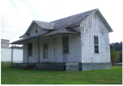
Railroad Section House in Richlands