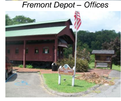
Railcar in Big Stone Gap serves as their visitor center