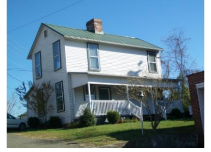
Railroad Section Manager's Home