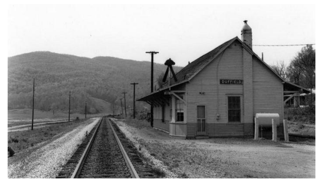
1950 photo of the Duffield Depot

Learn more on Dante Depot & examples at http://trailsrus.com/