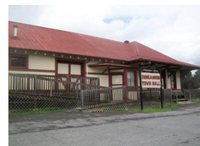
Dungannan Town Hall