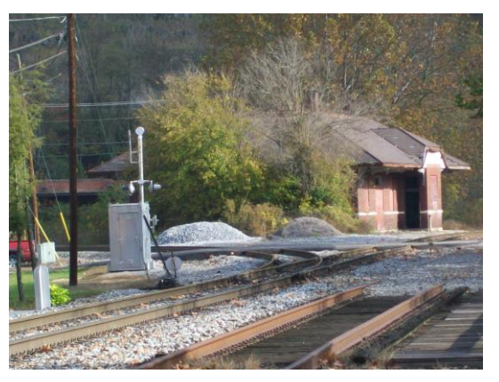
View from the old City Hall

Below is the view from old City Hall. Removal of a few trees and brush will make this a perfect location to view and interpret.