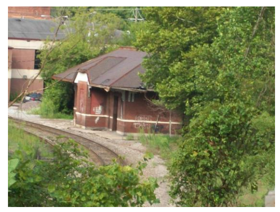
View from freight depot