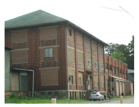
Freight Depot in Appalachia