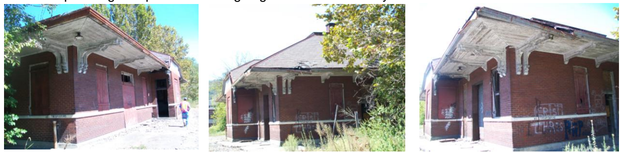
What the passenger depot does have going for it is that it is very viewable from more than one location.