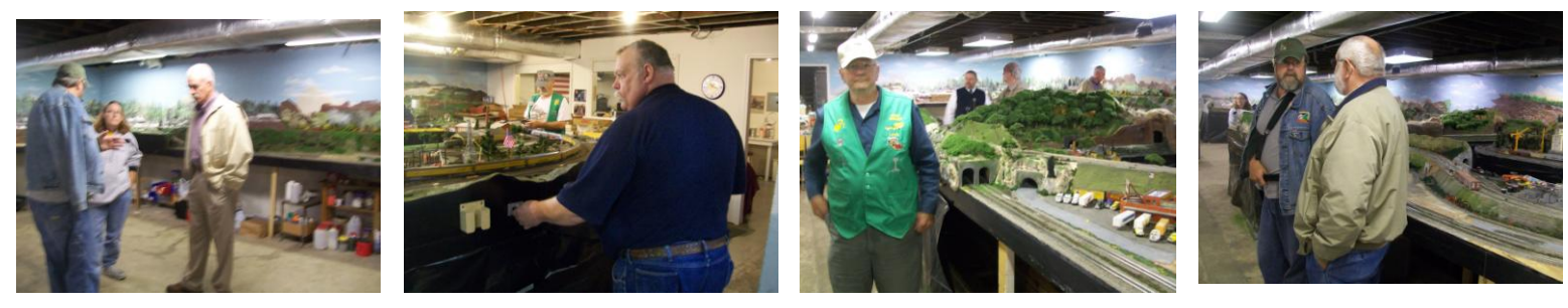
More photos of the model railroad area which fills two rooms.

Access to the lower level is very limited and definitely needs work to make it ADA approved. The freight elevator converted for duel use as a passenger elevator will alleviate part of the issue but allowing public viewing on a more regular basis is a must. The exhibit is just too awesome to keep behind locked doors. A curator for the museum who can police who enters the lower level along with television monitors for those times when visitors are downstairs should allow the exhibit to be a little more accessible for viewing.