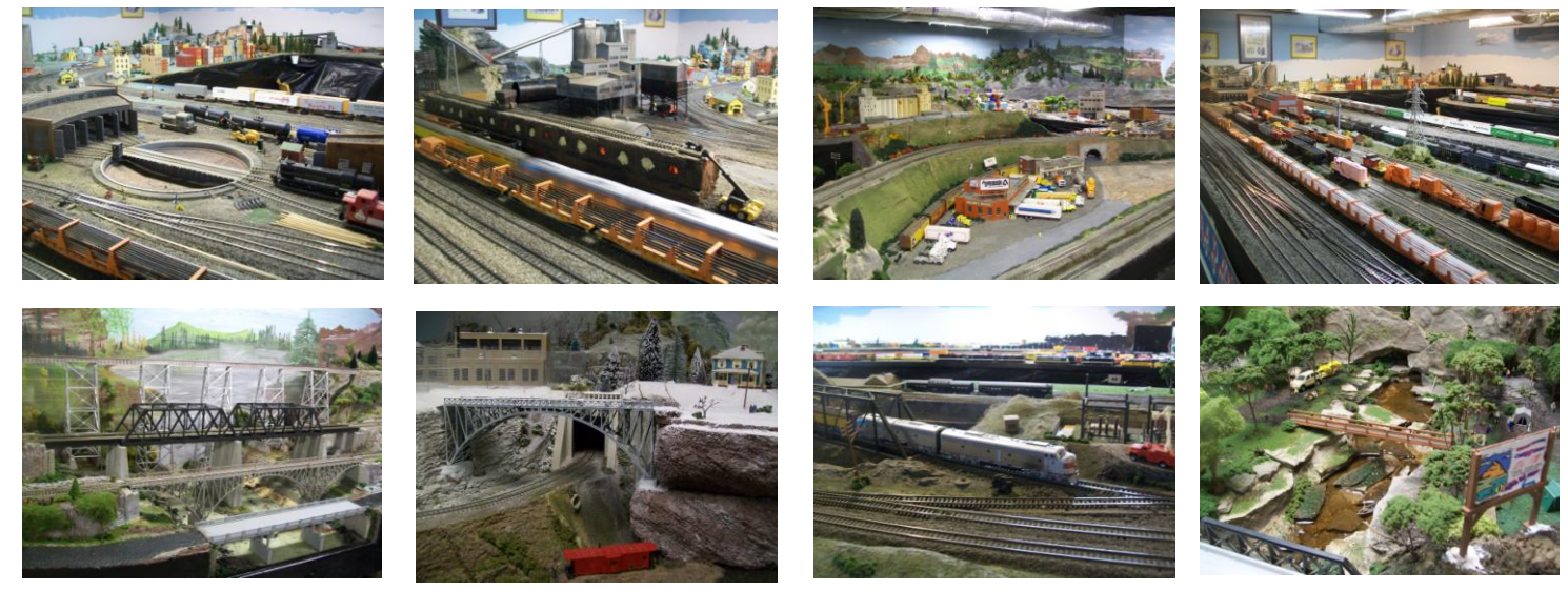
Note from consultant: I have never seen anything like it and it just keeps growing! This does not even begin to show it all. One will just have to visit Appalachia. That is all that can be said.

In the basement of Appalachia Cultural Arts Center is the most unbelievable model railroad display!