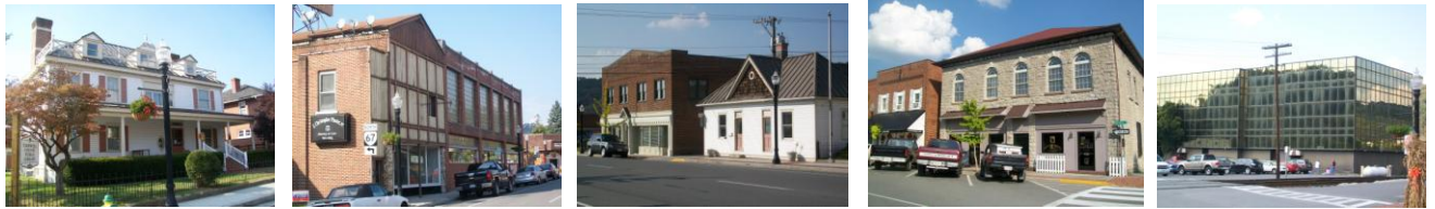
A few of the buildings to include on a downtown walking tour