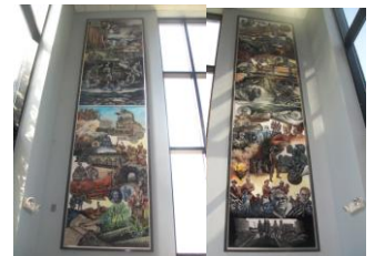
Murals at SWVCC