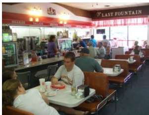
The Last Fountain & Pharmacy