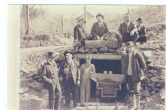
Brown Hollow Mine at Big Creek