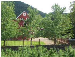
Old Mill – For Sale