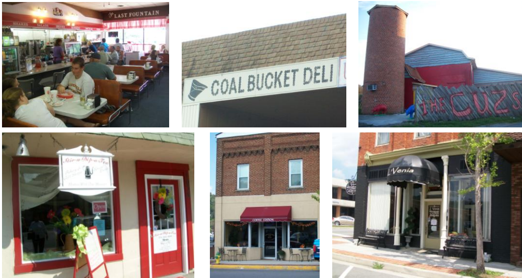
The Last Fountain (Bluefield), Coal Bucket Deli (Tazewell), The Cuz's (Pounding Mill), Stir-N-Dip-A-Tea (Cedar Bluff), Coffee Station (Richlands), L'Venia (Richlands)