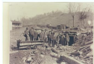
Red Ash Mine

Two other Coal Camps that once existed near Richlands were Red Ash and Brown Hollow: