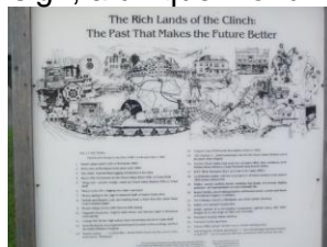
Highlights of Richlands

Recommended Loop on Hwy 67 N parallels with the railroad track taking the visitor past a historic marker, a map of Richlands, a War memorial, a farmer's market, a cemetery, a unique "coal" welcome sign, a unique monument as well as a few fast food restaurants and shopping opportunities.