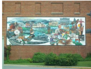
Mural on RR Street