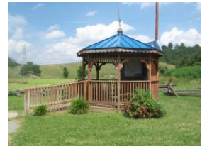
Tourism Kiosk across from museum