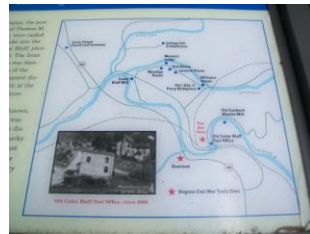
VA Civil War Trail site