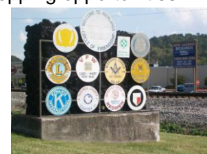
Unique Sign of Coal.

Two other Coal Camps that once existed near Richlands were Red Ash and Brown Hollow: