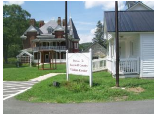
Tourist Info Center