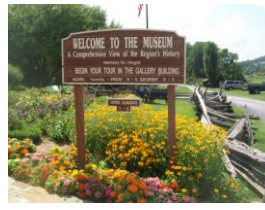
Crab Orchard Museum