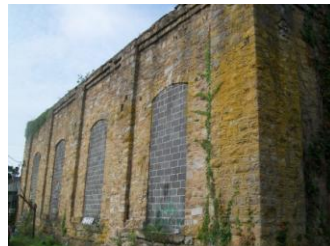
Keokee Coal Power Plant later became a theater

Recommendation: Interpretive signs need to be placed at the old power plant/theater and at the commissary providing information on how the community once looked, the jobs it created and all it once had to offer.