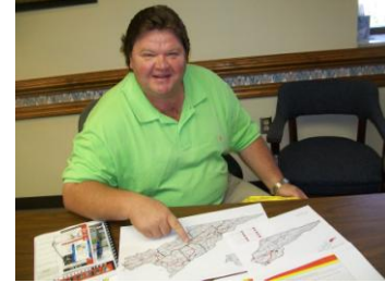
Two of the attendees at the Lee County Meeting

Below is the section of the Byway discussed in the Lee County meeting. Primary coal sites are noted on the map.