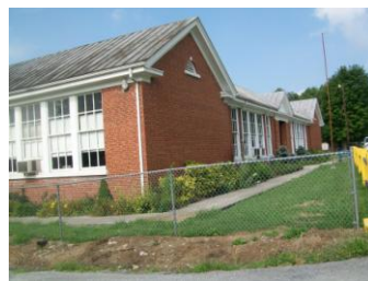
School at site of old hotel