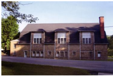
Keokee Commissary now a gymnasium