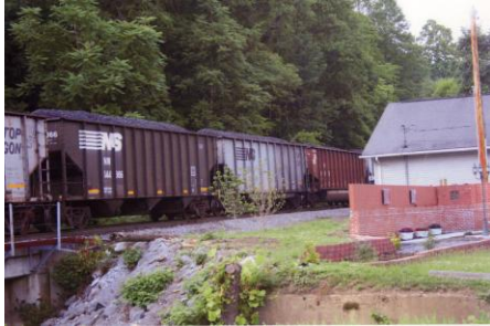
Miner Memorial next to railroad

There is a memorial to the miners near the RR tracks where one turns to go towards the remains of the Bonny Blue Mining Camp.