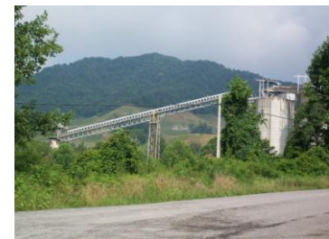
Keokee Mine Site

There is a pull off area just as one crosses into Lee County from Wise County on Hwy 68 where it suddenly turns into Hwy 606. This would be a good location to provide a map highlighting some of the sites one should look for along this portion of the route but more importantly, the proposed site is very close to the currently active Keokee Mine Site which is quite visible along the route of the byway. This could be an excellent opportunity to talk about how coal is mined today providing a person a better understanding of what they as they head down the mountain.