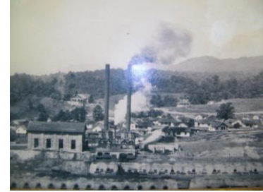
Power plant & coke ovens at Keokee. Power plant still stands today.

Over 200 coke ovens once fired up in Keokee. A few coke ovens still remain but are not accessible by the travelers. But what does remain is the old power plant which was connected to these coke ovens. It was later converted into a theater but this too has closed. Keokee still has the old Commissary which is in excellent condition having been converted into a gymnasium years ago. The exterior looks much like it did years ago. The elementary school stands where the old hotel once stood. Other towns that eventually became part of Keokee included Uptown, Mohawk, Darnell, Shepherds Hill and Rawhide.