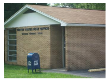
Keokee Post Office

Other businesses in Keokee include a convenience store, a post office, the school house and some homes. Kelly’s Convenience store located next to the old Power Plant could benefit from visitors stopping in but could use better indoor lighting and some interior reorganization to make it more appealing to tourists.