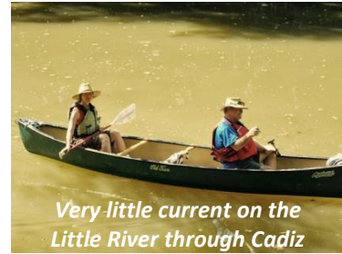
Very little current on the Little River through Cadiz

The Little River runs through Cadiz, KY enroute to Lake Barkley. By the time it reaches Cadiz, very little current exists. It is essentially a backwater of Lake Barkley which means it is a very slow-moving stream with little current by the time it reaches Cadiz.