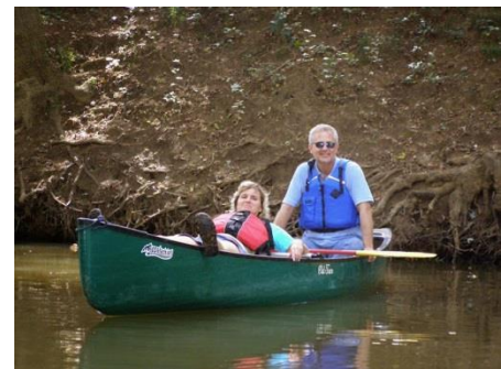
A trolling motor would be nice...