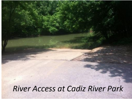
River Access at Cadiz River Park

A nice access for motorized boat use is available at the Cadiz River Park. This access is also fine for non-motorized craft like kayaks and Stand-Up-Paddle Boards (SUP) which are growing in popularity and fairly inexpensive to purchase. Heading downstream (to the right at the access) one can reach Lake Barkley in less than an hour of paddling. The river widens and flattens as one approaches the lake.