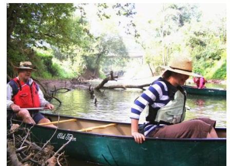
Access from the bank near KY 272 is very steep and muddy.