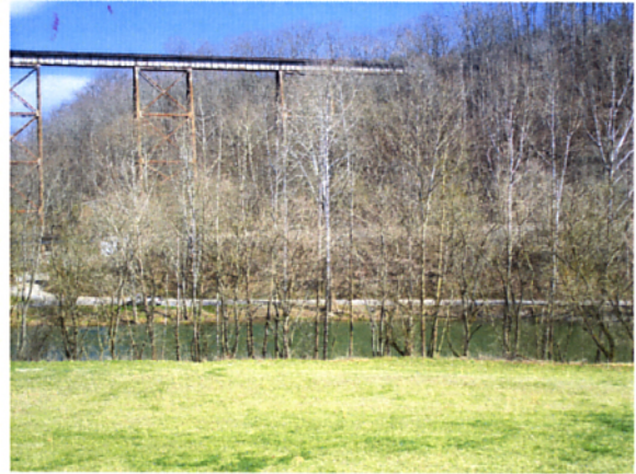
The Copper Creek Railroad Trestles are still visible today.