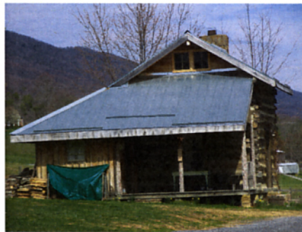
Old home place of A.P. Carter