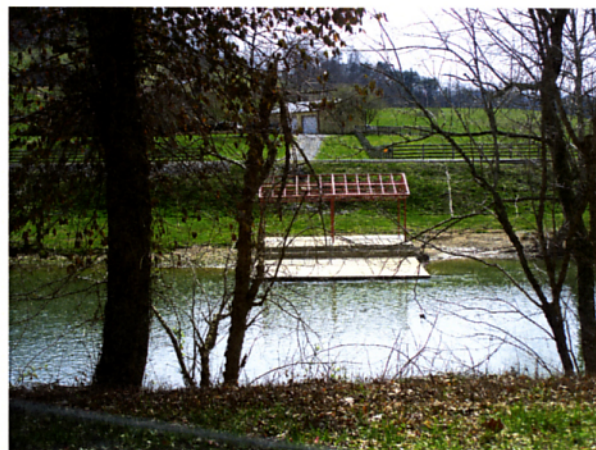
Across the river from the mill is a new dock and covered pavilion.