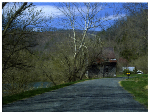
The route takes one past the old Holston Grist mill.