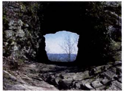
View of Wagon Tunnel on top of Little Black Mountain. The mountain ridge is the KY/VA state line.