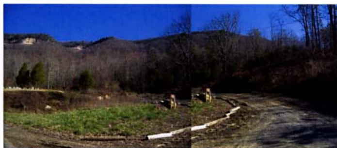
Trailhead (next to Cemetery) leading to trails to Yellow Mt. is currently closed.