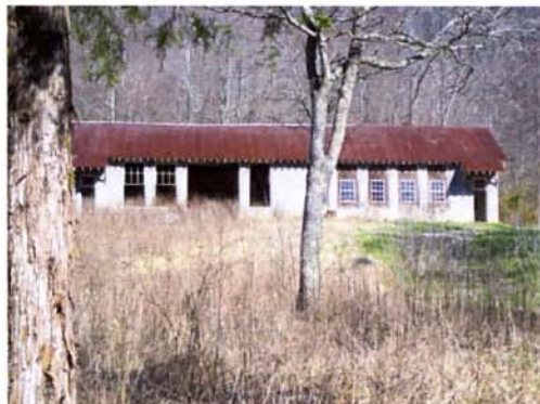
Potential to convert old school into lodging facility for ATV riders if building is still structurally sound.