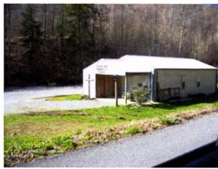
Community Center also along the route.