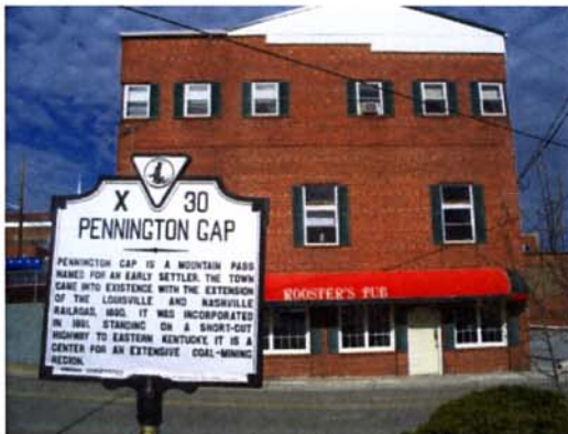
Rooster's Pub is an excellent restaurant we ate at while touring the area. It is located down near the railroad track in Downtown Pennington Gap.