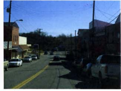
Views of the Town of Jonesville as one drive east along VA 58