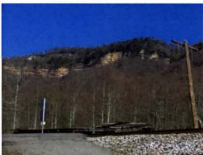
View of Yellow Mountain

Hell's Trail is in rough shape and washes out – Considered a black diamond. There is a way to drop down and avoid it. Trail will take rider to Harlan Substation in Kentucky.