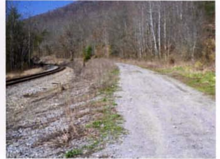
Hagan's Trailhead is located next to a railroad track