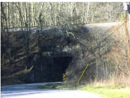
Tunnel one passes through as one nears Hagan ATV Trailhead.