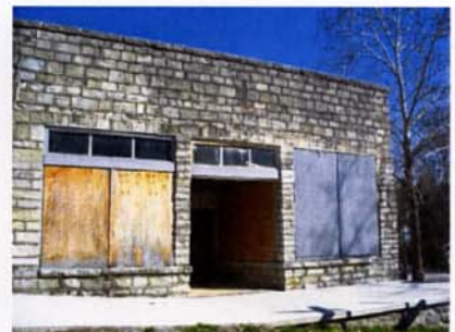
Vacant buildings that may find a new use if Spearhead Trail System reaches full potential in Lee County.