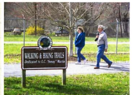
Leeman Field Park in Pennington Gap has a lot to offer including a walking track and access to Powell River.