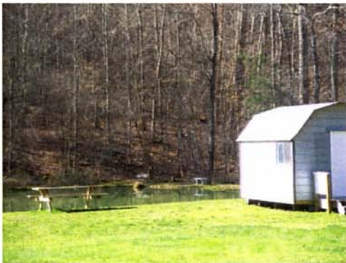
Small privately owned pay lake is located along Hubbard Springs Road.

Across the road, a large hotel once stood and attracted many visitors who came to see the Wagon Tunnel and enjoy the "healing powers" of the seven springs which still flow today. Someone has recently begun cleaning up the area and cleaning out the springs so they can flow more naturally as they once did.