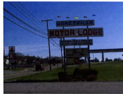
Jonesville Motor Lodge across the street.