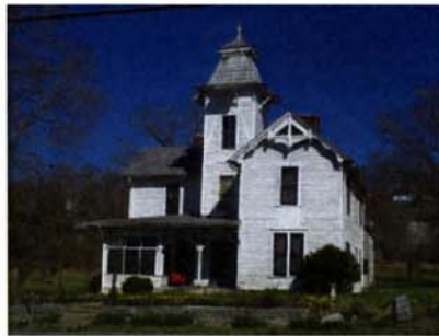
Historic home on VA 58 in Jonesville.