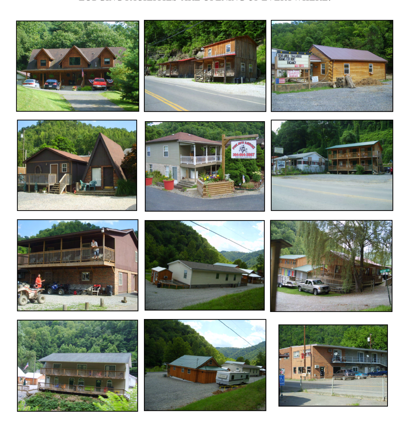
Over 130 rooms to rent in Gilbert and more opening soon! People are even adding lodging on the upper floors of downtown busineses.