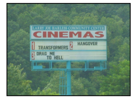
An ambulance service, Family Dollar Store, 3-plex cinema and community center are just a few of the other businesses that have sprung up in Gilbert WV in the past couple of years.