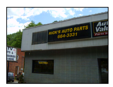
There are three auto parts and repair stores in Gilbert.