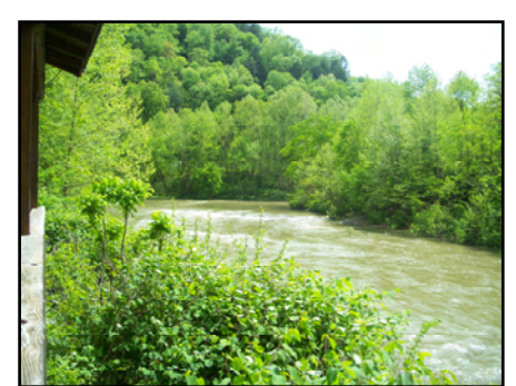
The pavilion in the center of town overlooking the water provides an excellent view of the river.