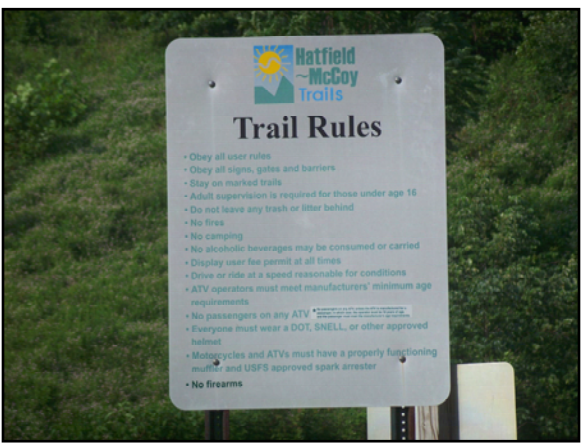
Whether or not you are on a trail or on a road, everyone must obey the rules!