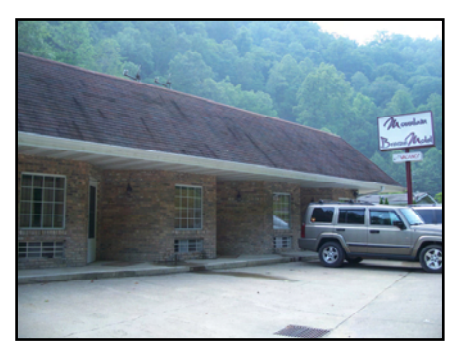
Mountain Breeze Motel is one of the only traditional lodging facilities in Gilbert. The rest are primarily cabins, converted homes or second floors of commercial buildings.