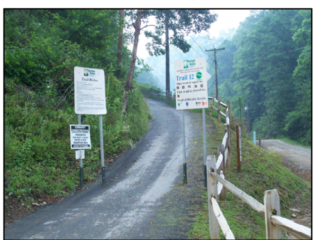
Trail #12 into Gilbert, WV