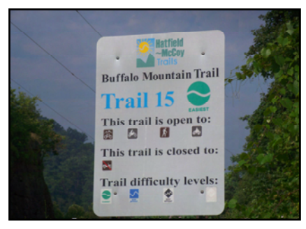
The trailhead above is located right outside of Williamson in Mingo County and is the access point to the Buffalo Mountain Trail which is actually a series of looped trails between Williamson and Delbarton WV.