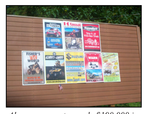
Above represents nearly $190,000 in corporate sponsorships for the trails.

The two couples (photo on right) from Metropolis Illinois drove seven hours to ride the Hatfield- McCoy trails. We met them at the trailhead just outside Williamson WV. The first time they rode the trails was last Fall 2008. They came back to ride again in June and planned to come back again in the Fall. They too were staying in the area seven days before heading back home.