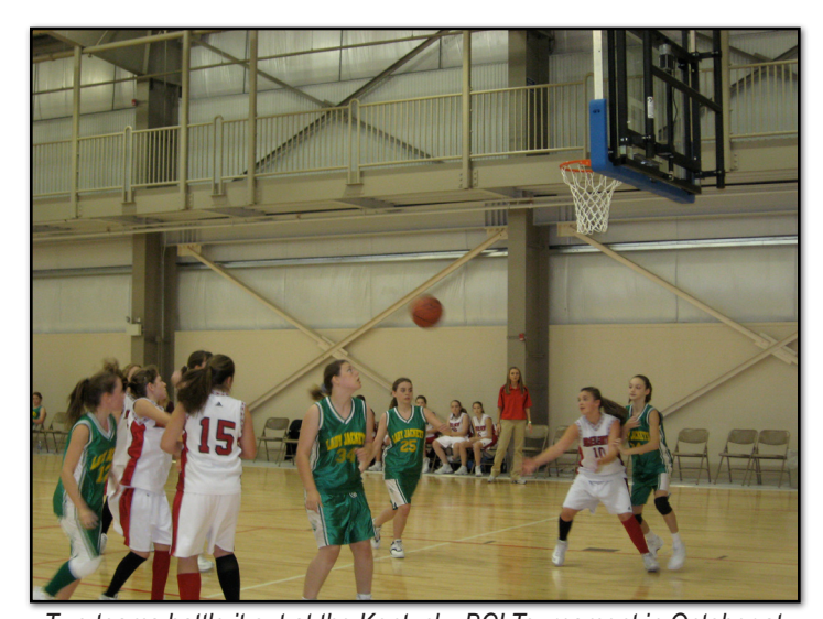
Two teams battle it out at the Kentucky BCI Tournament in October at the Sportsplex.