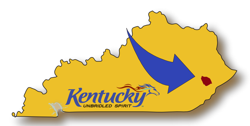
20 minutes east of Prestonsburg and 30 minutes west of Hazard on Hwy 80.

In addition to being the home of the Mountain Legends' Hall of Fame, Knott County Little League and BCI basketball, we look forward to hosting regional and statewide sporting events.