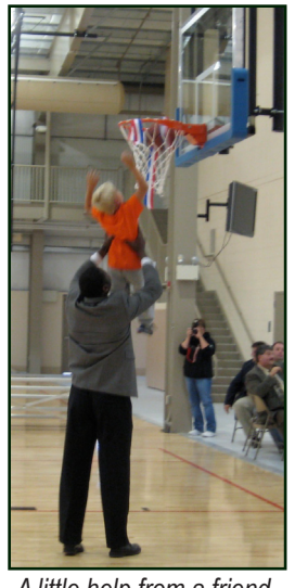
A little help from a friend.

Mini All Stars (boys and girls ages 4-6) Little Champions (boys and girls 7-8) Girls Semi-Pro League (ages 9-10) Boys Semi-Pro League (ages 9-10) Girls Pro Division (ages 11-12) Boys Pro Division (ages 11-12)