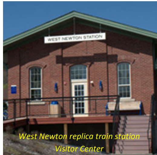
West Newton replica train station Visitor Center