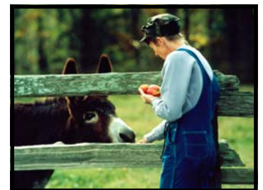
One of the entries

Submit your photos of people having “fun on the farm” in our statewide photo contest. Cash prizes available plus an opportunity to have your pictures featured on both the agritourism website and/or publications. Go to 10000trails.com/agritourism and click on Photo Contest for entry forms or call (270)781-6858.